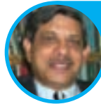
Prof. Humayun Ansari ROYAL HOLLOWAY, UNIVERSITY OF LONDON

It is important to increase the ratio of good parliamentarians who support just causes and lead by example".