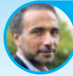
Prof. Tariq Ramadan OXFORD UNIVERSITY

"This is a crucial opportunity for you to potentially shape the political reality for the next few years – make sure you make your mark!"